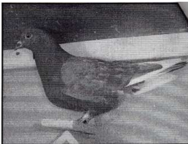
Andalusion White Flight – 03 CNTU 005