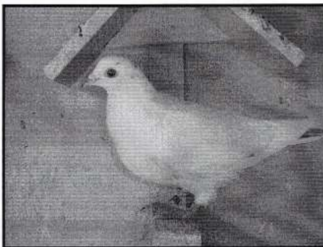
Almond – 03 CNTU 008